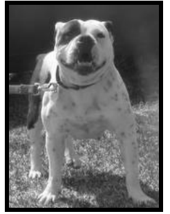
Camilla at the shelter

ous meetings, it gives you the chance to drop by, see who's new, and just take the opportunity to give someone a pat or receive a big sloppy kiss. As chance would have it, Stella had originally been placed in a kennel with a rescued English bulldog named Camilla. Camilla was rescued from a local farm and from the second she was brought into the shelter, she won everyone's heart. I was no exception. I became very vocal about wanting the opportunity to bring her home if she was available for adoption. After four