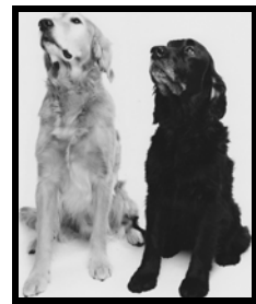
Moses and Katy (aka Ladybug)