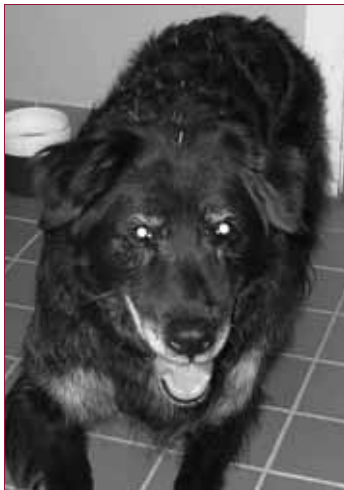
Tobey having an acupuncture treatment

One of your staff found him - crawling out of the brush, falling into the road, covered with frost – with a badly broken rear leg. She gently lifted him into the cab of her truck where he immediately laid his head in her lap. He had long black fur, chocolate pudding eyes and black spots on his tongue. He was some kind of black lab mix – with possibly flat coat retriever. Cochecho Valley Humane Society advertised that they had found “Frosty” but no one came to claim him. Thanks to a special fund, his broken leg was repaired.