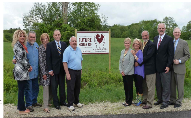
The CVHS Building Committee and County Commissioners celebrate the new "Future Home of CVHS" sign

The new facility is based on another shelter that services an area similar in size and population to Strafford County and Southern Maine. Every room has undergone extensive planning to make sure that it is efficient and meets our needs. While it will be larger than what we currently have, it will not be large or lavish.