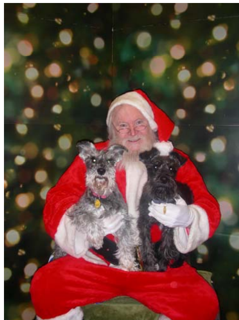
Sasha & Simon

"I am so in love with these dogs! Thank you for letting me adopt them!"