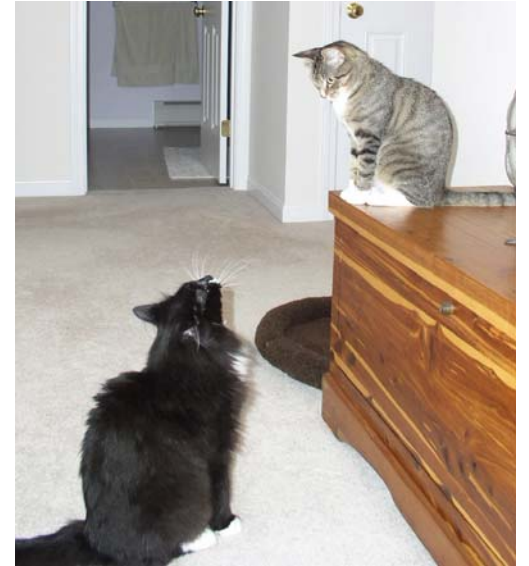
Ross & Brock

"Brock is adjusting well. My other cat, Ross, also adopted from CVHS a little over a year ago, is thrilled to have a playmate."